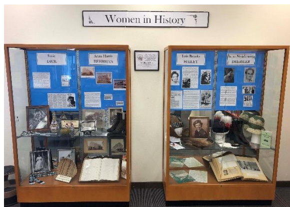
Exhibit at Lake Tahoe